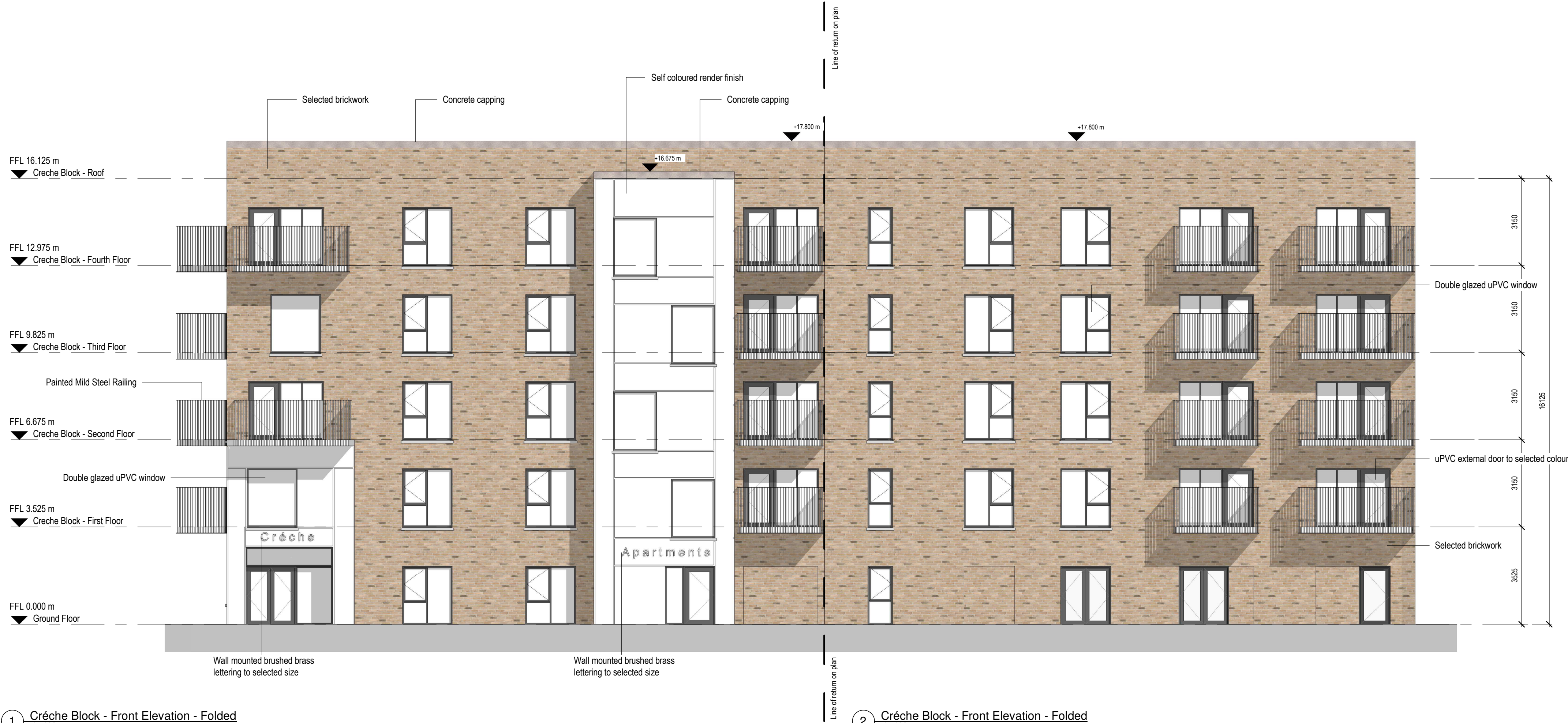
1 Crèche Block - Front Elevation - Folded 1:100