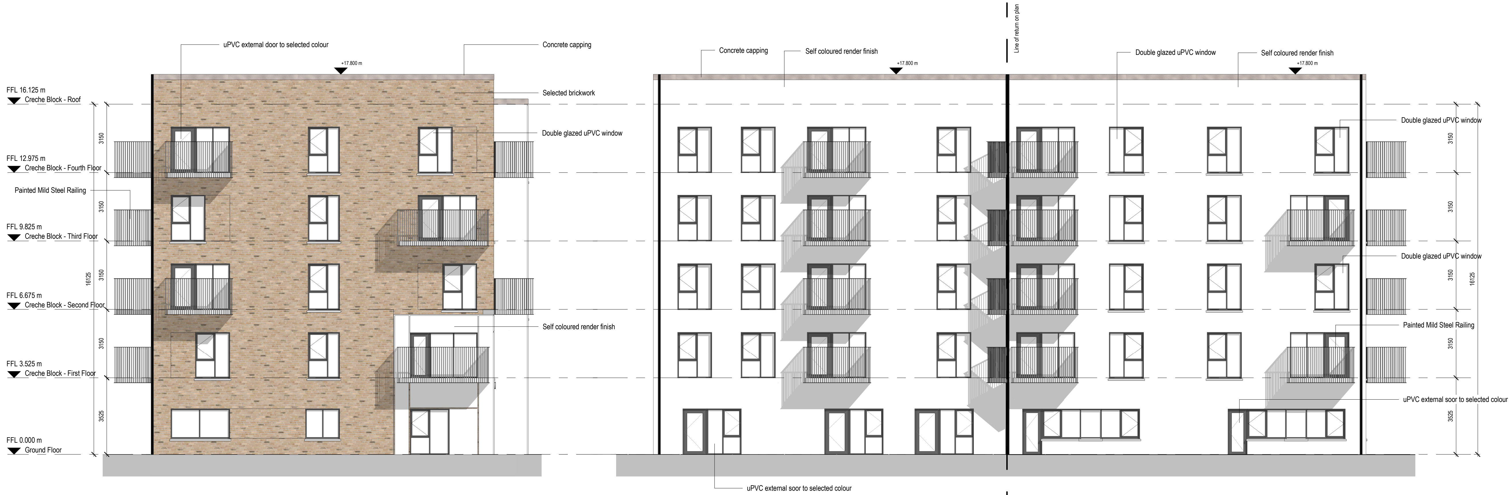
3 Crèche Block - End Gable Elevation 1:100