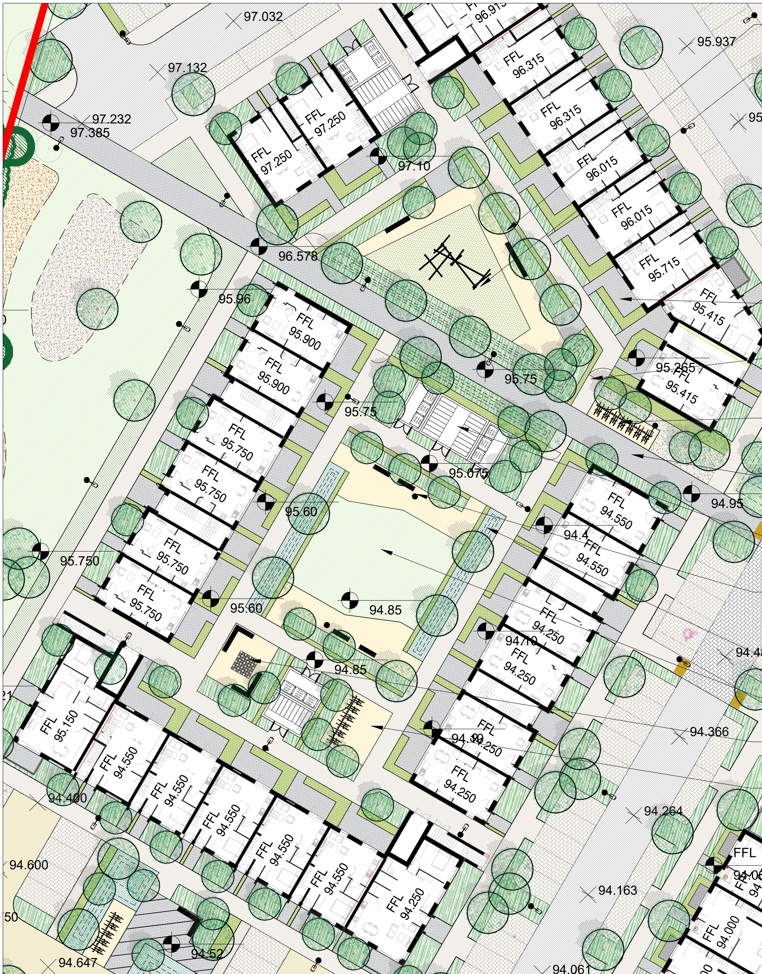
DETAIL AREA 2 - Communal Open Space - 1:250@A1