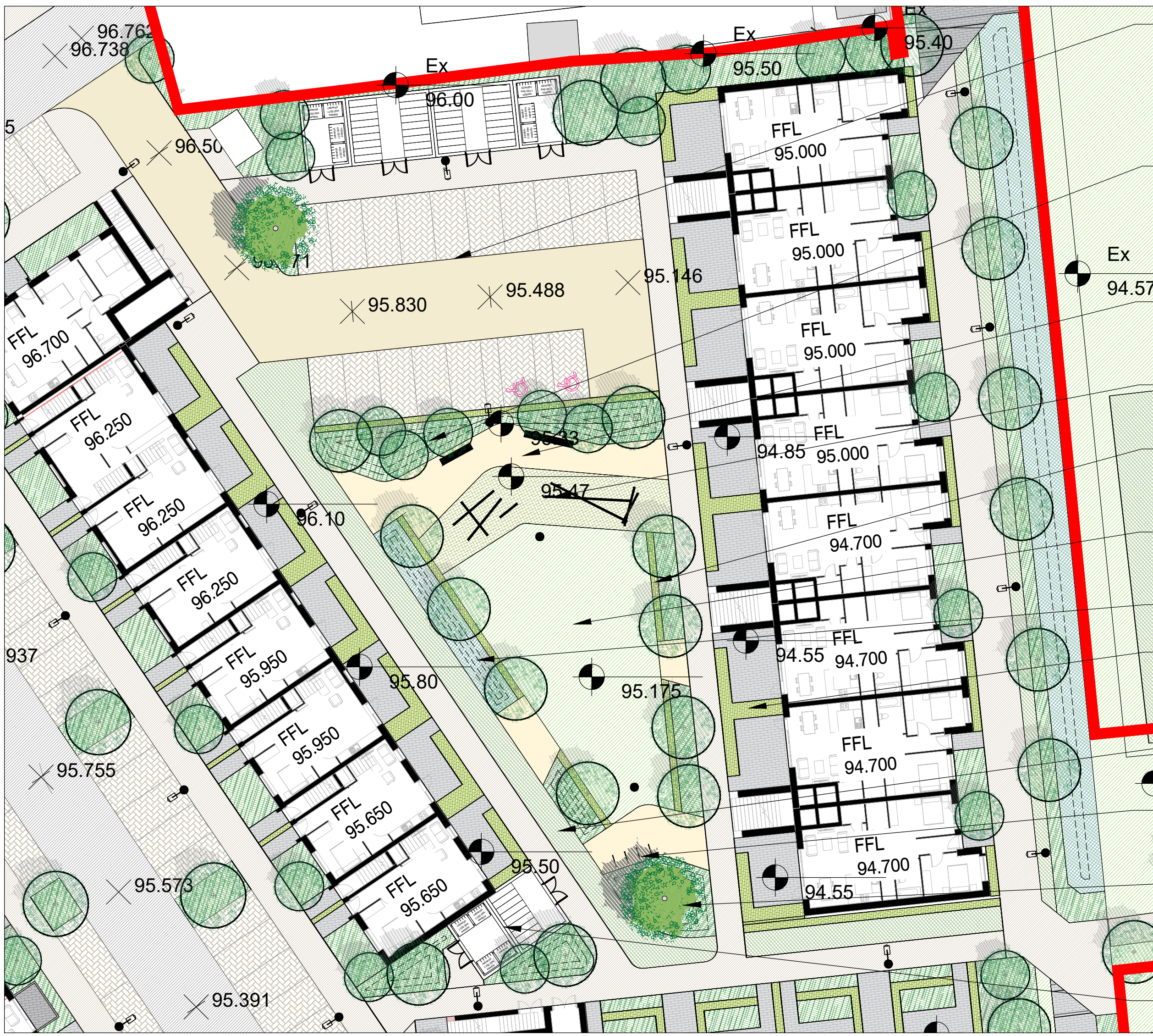
DETAIL AREA 1- Communal Open Space - 1:250@A1