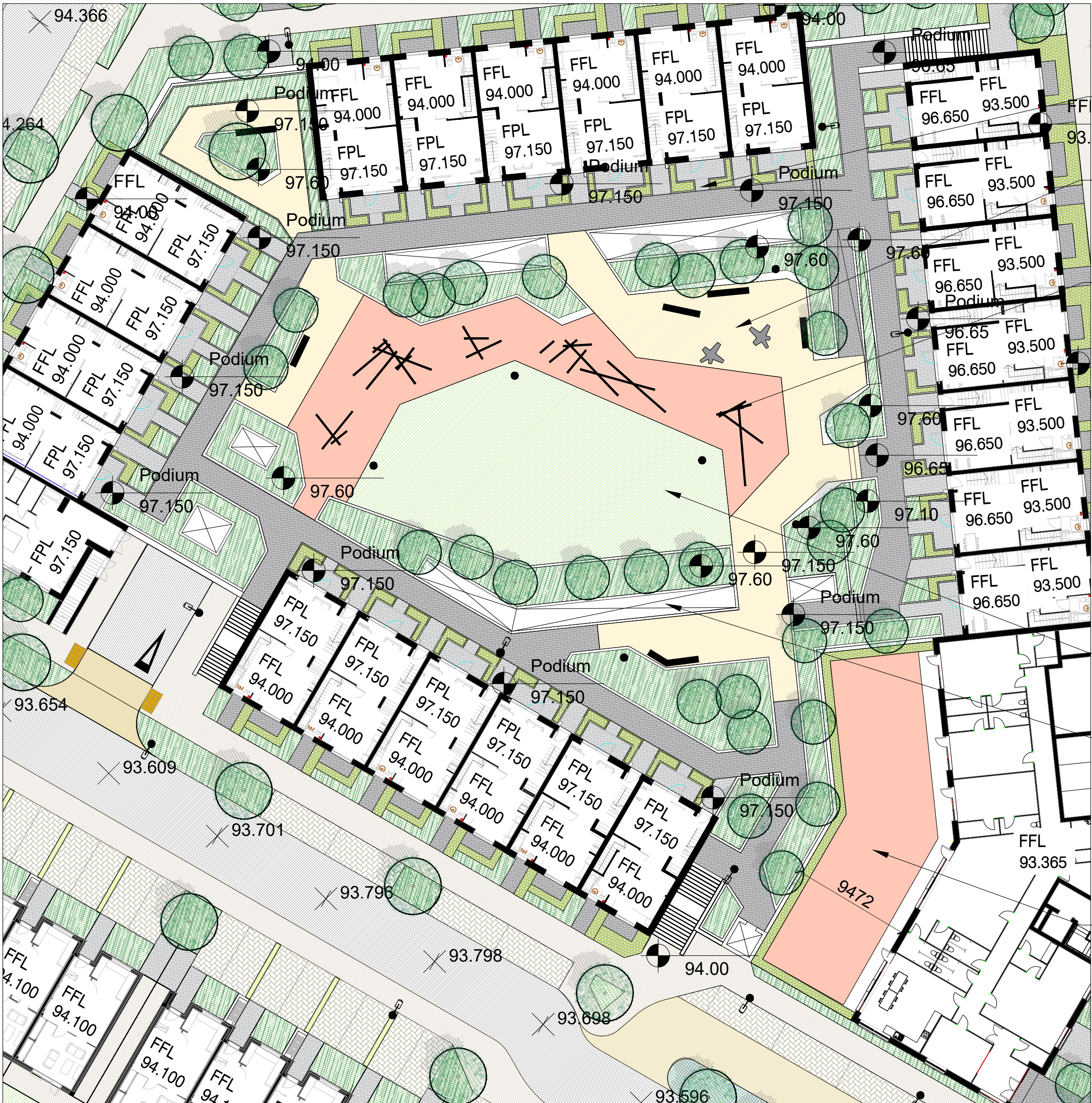
DETAIL AREA 4 - Communal Open Space - 1:250@A1

PRIVATE OPEN SPACE TO HAVE HEDGING IN RAISED PLANTERS